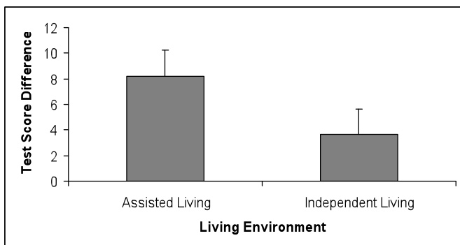
Figure 2 Mean difference in test score by living environment. Score difference between assisted living ( M = 8.23 , SD = 4.61 ) and independent living ( M = 3.63 , SD = 3.38 ) environment groups was significant; t(111) = 5.32 , p < .001 .

Participants' SLUMS and MMSE scores were significantly different. This finding remained consistent when examining the average SLUMS and MMSE scores of participants residing in assisted, independent living, skilled nursing, and "other" living environments. When the mean difference in scores between the assisted living and independent living environments were compared, evidence was found suggesting these groups significantly differed in their difference scores. This provides compelling evidence that the SLUMS may be more sensitive at detecting cognitive impairments when individuals are in the mild cognitive impairment range, as seen in the non-independent living participants' difference scores.